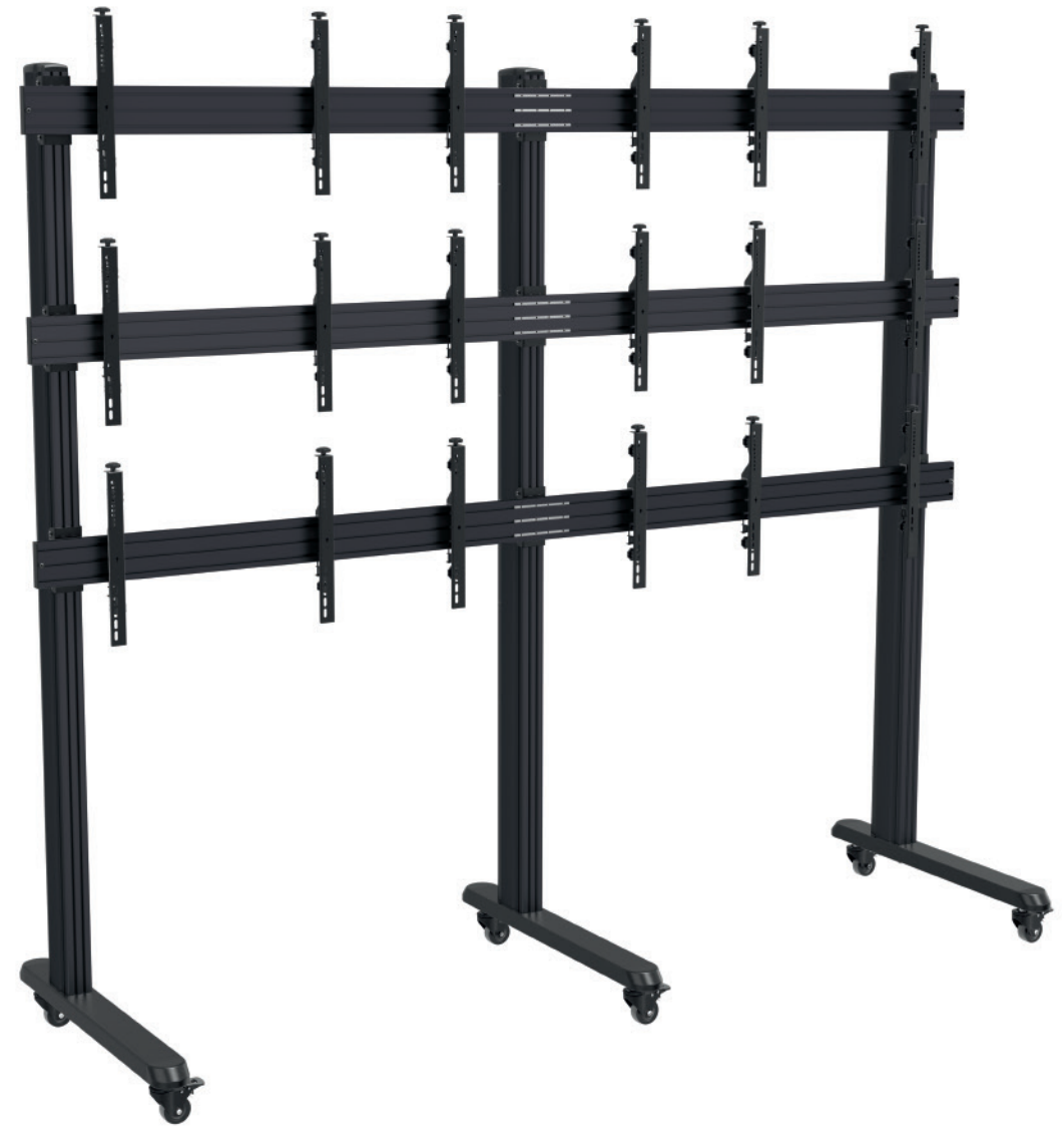
Technical changes reserved | This document is the property of HAGOR Products GmbH. Forwarding and duplication of this document, utilization and communication of its contents are not permitted unless expressly permitted. A violation obliges you to pay compensation. All rights reserved in the event of a patent, utility model or design registration.

The surfaces of the HA-VWT 3 x 3 Landscape are finished with an impact- and scratch-resistant powder coating in black.